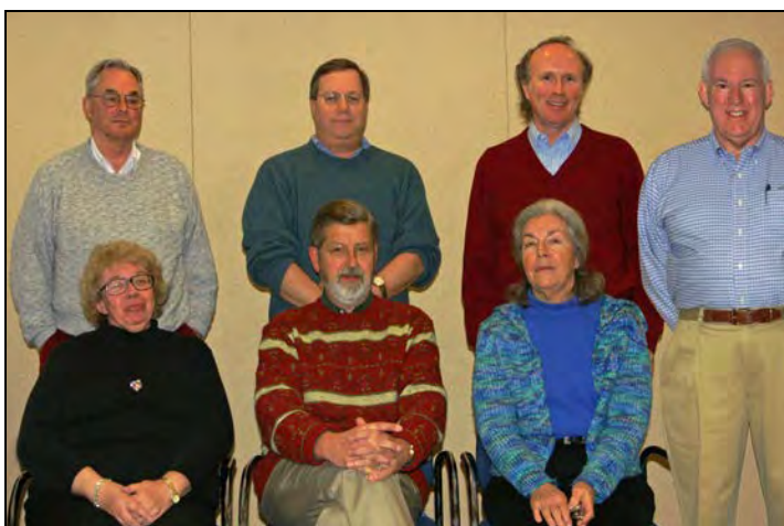
The TEHS Board of Directors