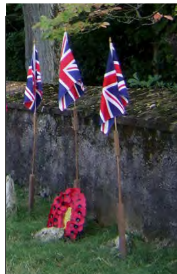
A wreath lies at the gravesites of the fallen British soldiers.