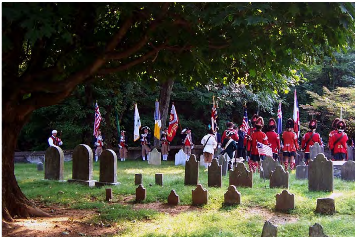
The Commemoration for the Fallen, St. Peter's Church in the Great Valley.