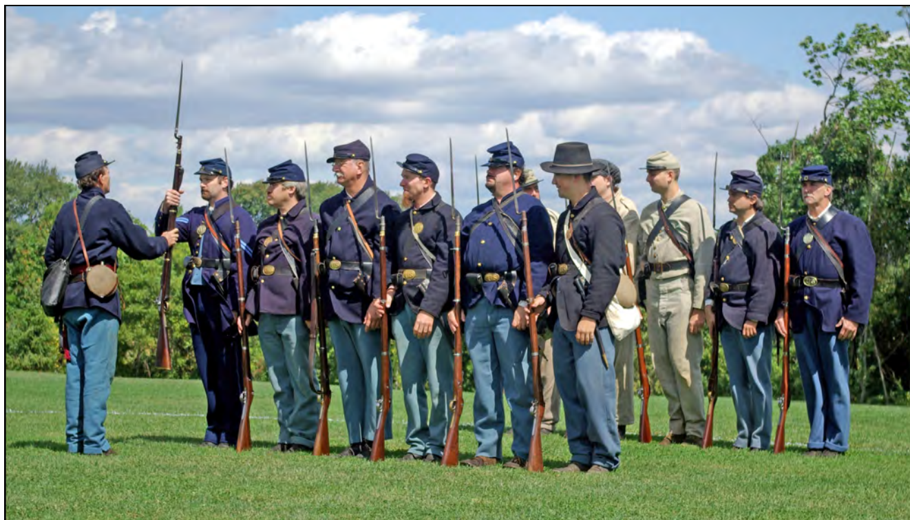
Above: Civil War re-enactors drill at Wilson Farm Park.

Below left: The whole family can enjoy the life of a re-enactor. These volunteers added to the historic spirit of the Tredyffrin 300 celebration.