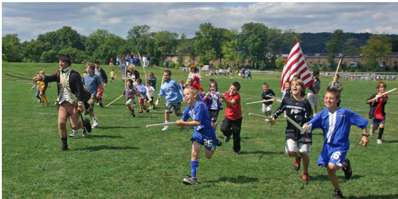
Above: Charge! Children enjoyed participating with re-enactors at Wilson Farm Park during the Birthday Party.