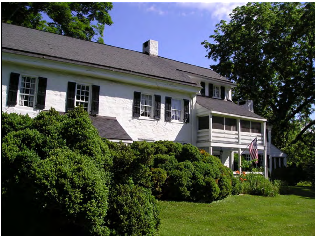
Above: The 3 rd Annual Historic House Tour included the quarters of General Anthony Wayne (circa 1757).