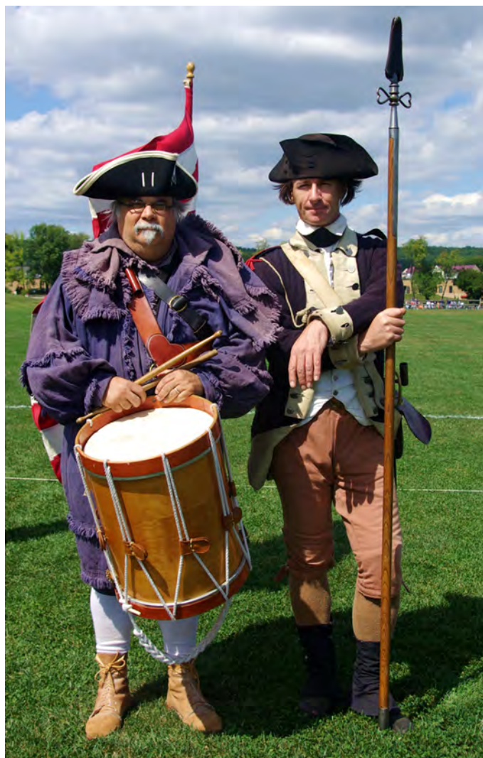
Left: A close-up of Revolutionary-era re-enactors.

Copyright © 2020 Tredyffrin Easttown Historical Society. All Rights Reserved. Authors retain copyright for their contributions.