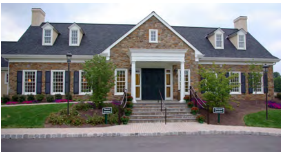
The recently remodeled clubhouse at St. Davids Golf Club, the location of the Tredyffrin at Twilight Soiree & Auction.