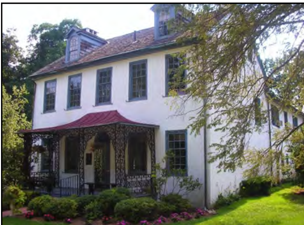
Left: General DuPortail's House (circa 1740) was the ticket pick-up point for the Tour.