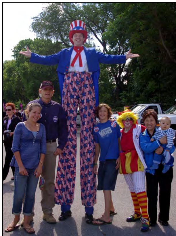
Right: Uncle Sam enjoyed entertaining visitors to Wilson Farm Park during the Birthday Party celebration.