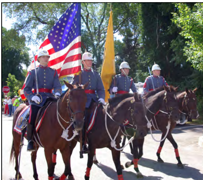
Above: Troops on horseback from Valley Forge Military Academy participate in the Birthday Party Parade.