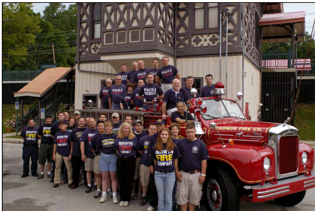
Volunteer firefighters from Paoli, Berwyn, and Radnor fire companies pose for the special 2007 Tredyffrin 300 calendar in front of the historic Strafford train station.

Tredyffrin 300 reached out to the business and corporate community by inviting them to become sponsors. Several supported this one-time-only celebration, including: Shire Pharmaceuticals, the Vanguard Group, Cedar Hollow Design Center, Unisys, Alliance Bank, the Baptist Church in the Great Valley, BioMed Realty Trust, Braxton's Animal Works, The Fox Companies, Lamb McErlane PC, Matthews Paoli Ford, Paoli Village Shoppes, Partners Advertising, the Picket Post Swim and Tennis Club, Pitcairn Properties, and Traffic.com. Shuler's Jewelers and Devon Hill Motors were special sponsors of the opening event, the Soiree and Auction held at St. Davids Golf Club.