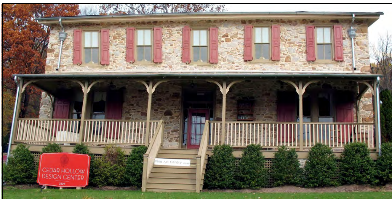
Below: Cedar Hollow Design Center on Yellow Springs Road had its roots as a post office in the town then known as Tablet. This historic property dates to 1840.

Copyright © 2020 Tredyffrin Easttown Historical Society. All Rights Reserved. Authors retain copyright for their contributions.