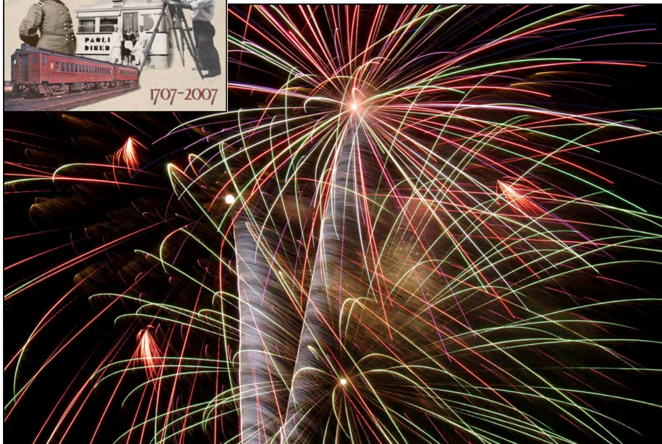
Below: The events of September 15, 2007 were capped by a fireworks display by the renowned firm Zambelli Fireworks Internationale. Joe Maugeri.

Copyright © 2020 Tredyffrin Easttown Historical Society. All Rights Reserved. Authors retain copyright for their contributions.