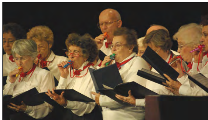
Above: The choir of Surrey Services was an enthusiastic participant in United in Song .