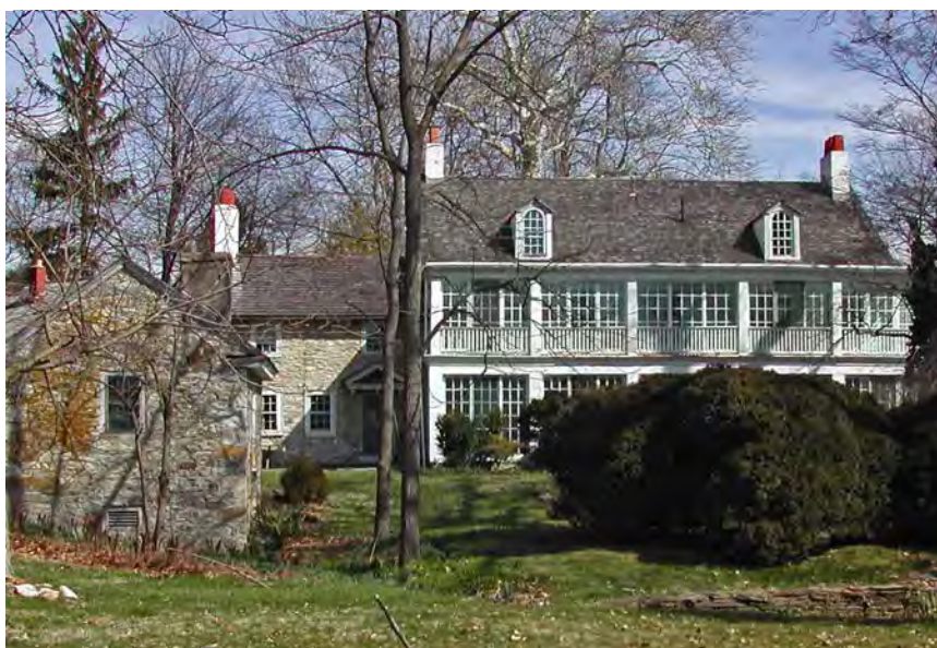
Malin Hall.

We are still left with the question why, in light of all this information, Malin Hall's claim was accepted for