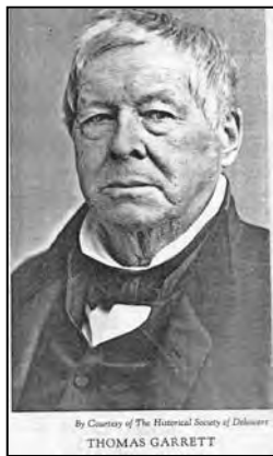
THOMAS GARRETT