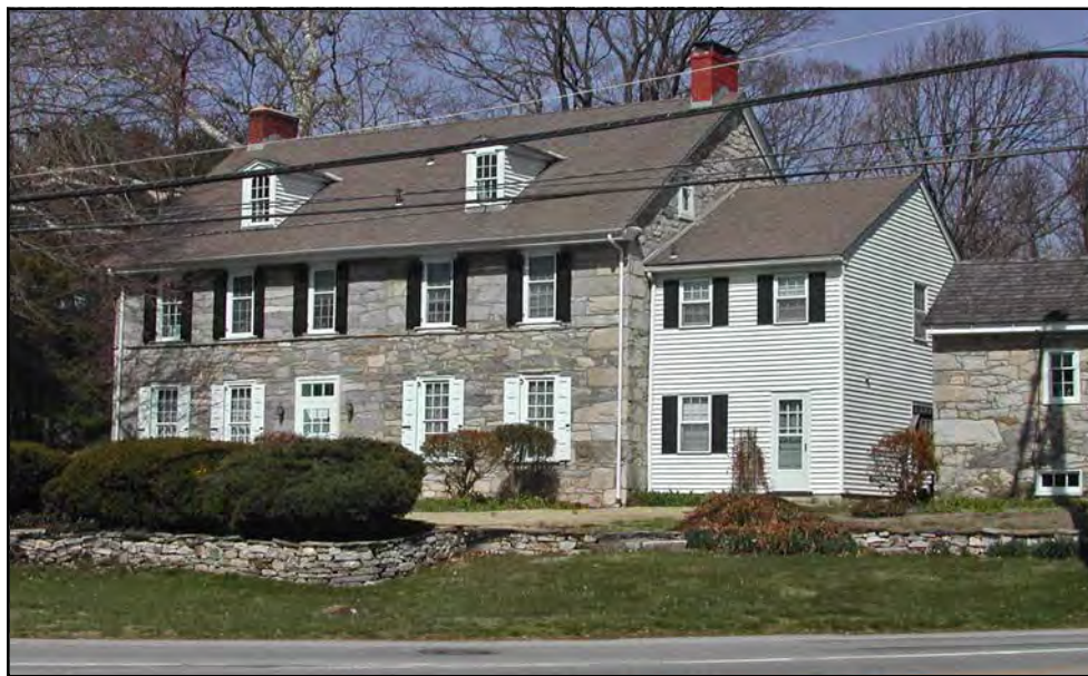
Malin-George House.