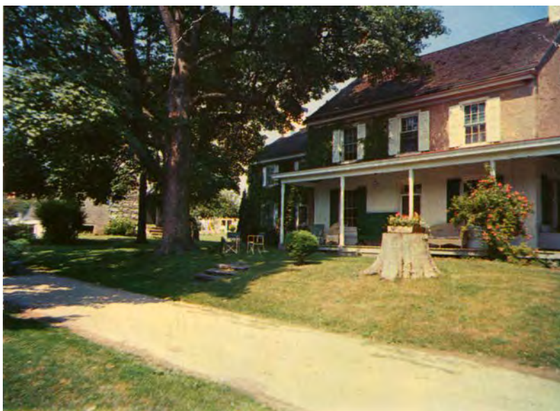
Brackbill-Haldeman-Malin House.