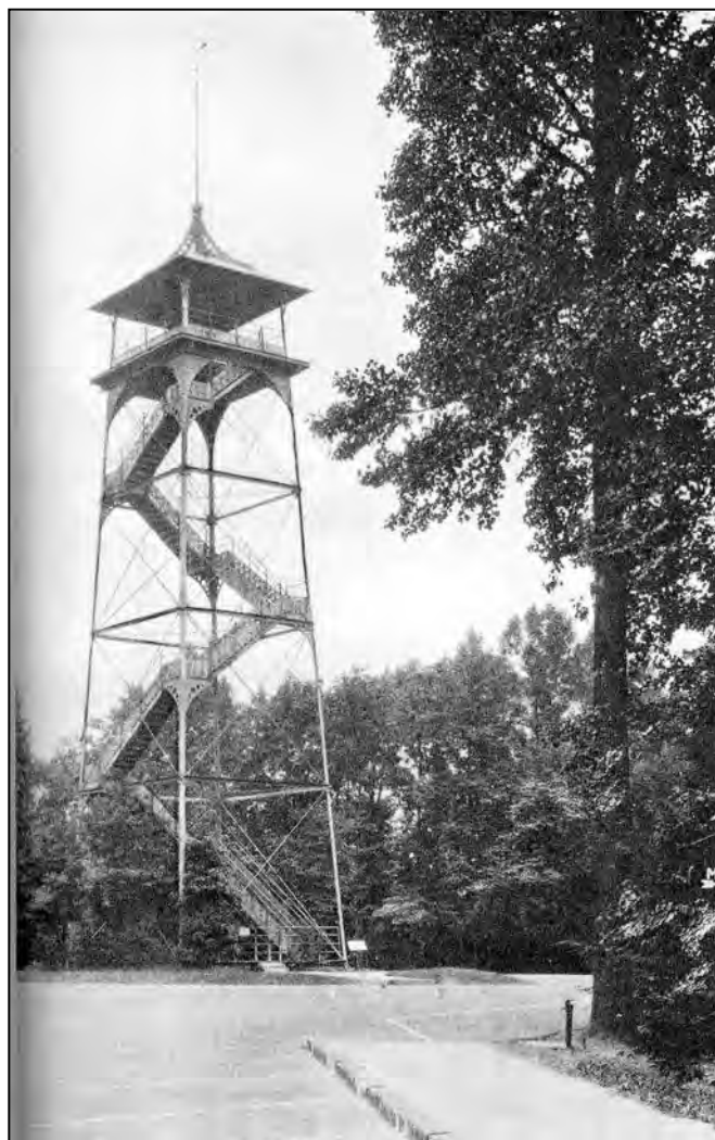
Valley Forge Postcard, 1920's or 1930's. Photographer unknown.