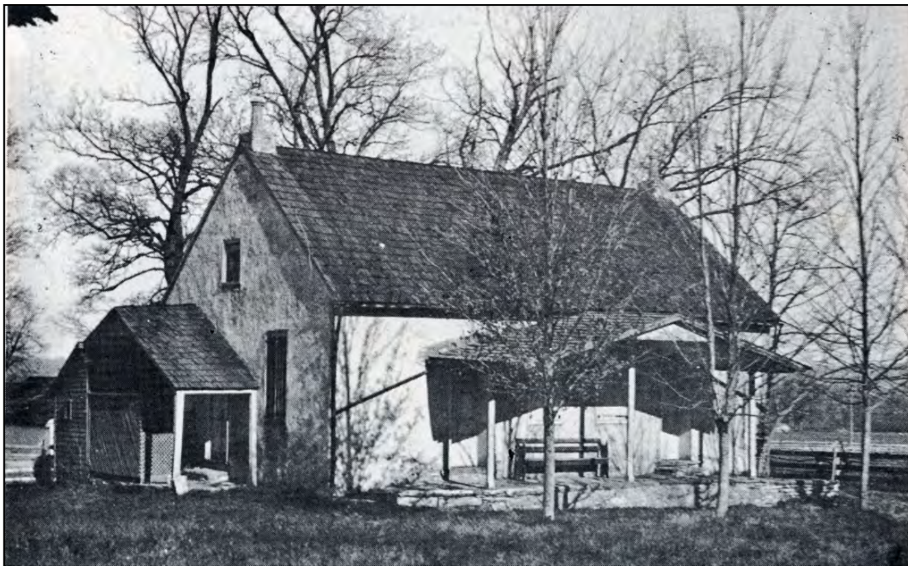
Whiteland Friends Meetinghouse.