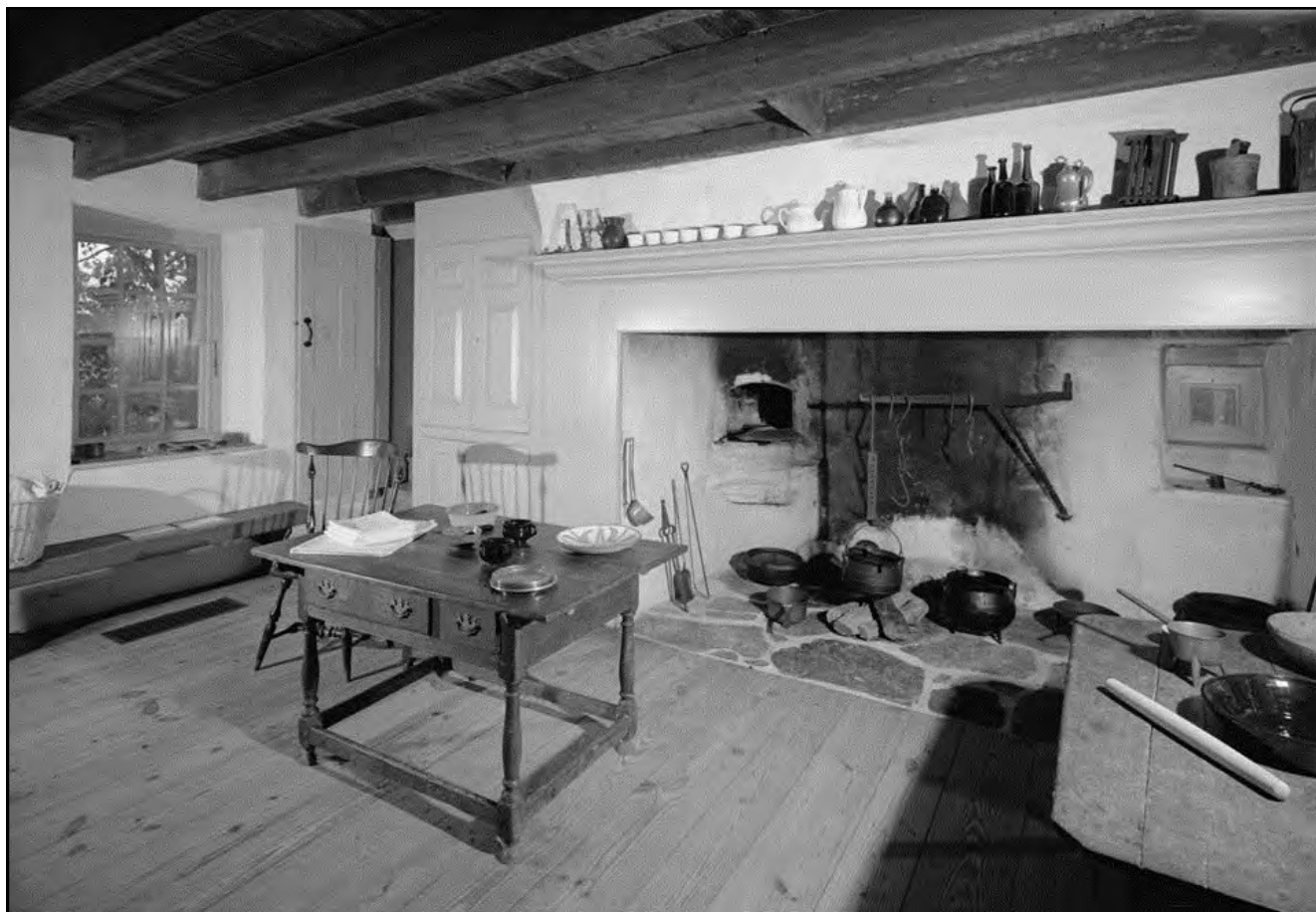
First floor interior of Varnum's Quarters.