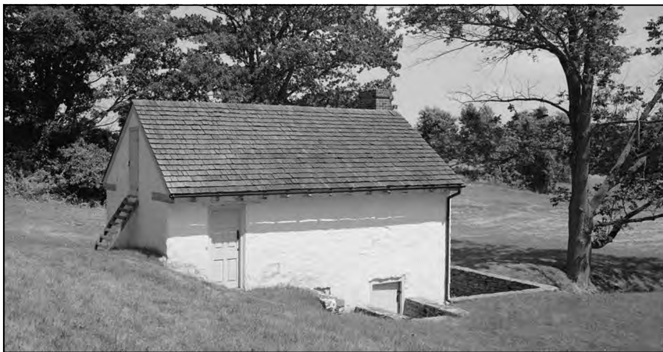
Restored spring house.