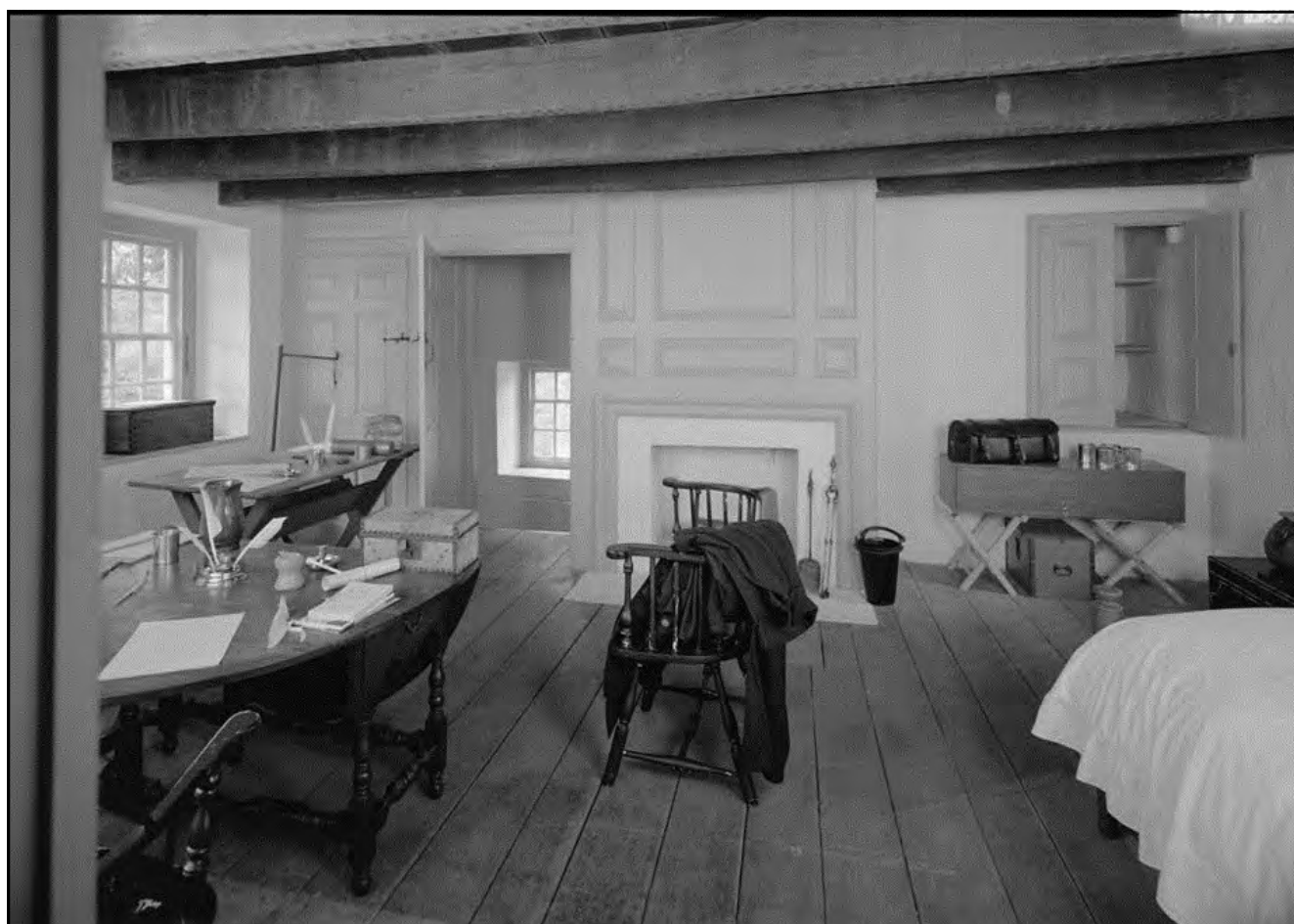
Varnum's sleeping quarters and office as it might have appeared during the encampment.