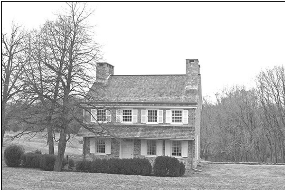
Present day view, looking north. Mike Bertram, February 2009.