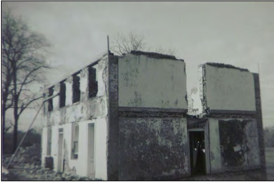
House under reconstruction.

Valley Forge State Park acquired the property in 1945. In 1963-1965 it was rebuilt in colonial style. The house is no longer open to the public.