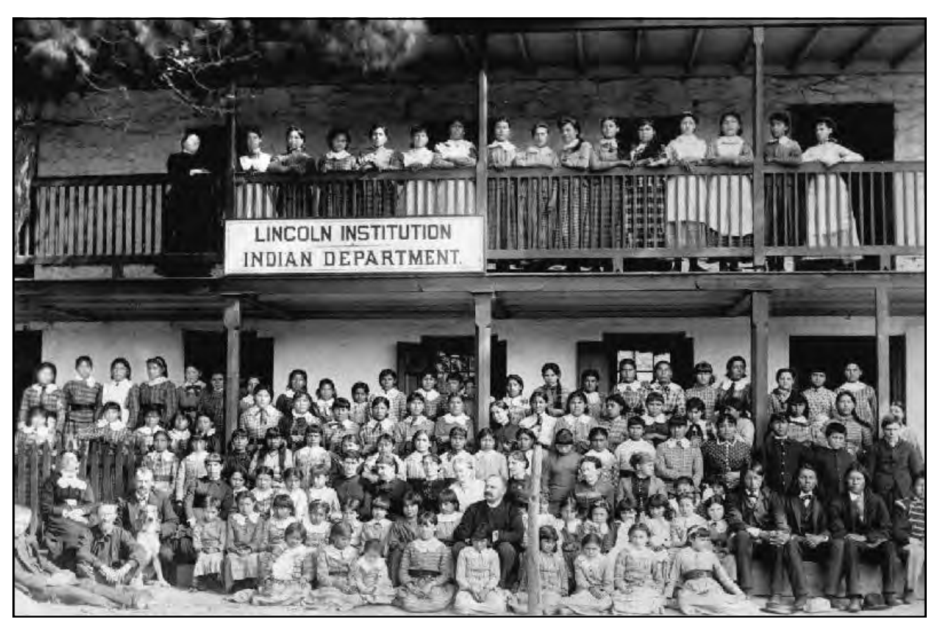
Students and teachers pose outside the school at the former Spread Eagle Tavern, October 1884.

summer location of the Indian School for the next two summers.