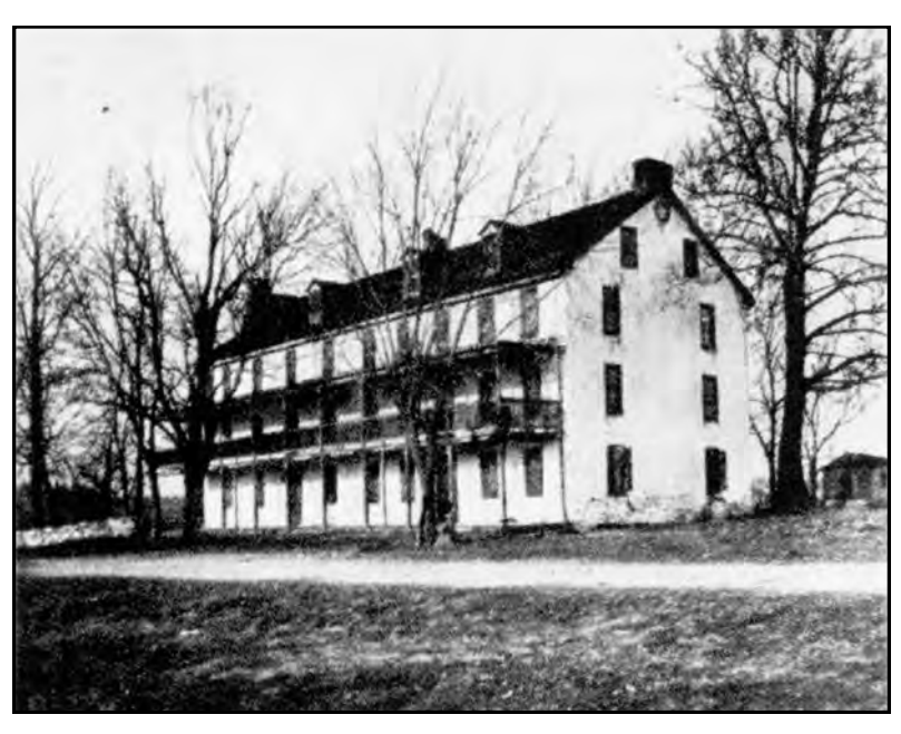
The Spread Eagle Tavern, in an undated photo from the Society archives.

rapidly acquire a knowledge of reading, penmanship, and music, many of them within a month, learning to speak English fluently, draw maps neatly, write correct compositions and play well upon the cabinet organ." The girls also all had lessons in vocal music, in which they showed "much interest and talent." Half the day was spent attending these classes, and during the other half of the day the girls received instruction in housework and sewing.