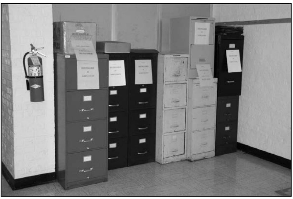
The hallway filing cabinets. All photographs by Kathy King, December 2009 & January 2010.

The archives were stored in a set of filing cabinets in a corridor and in a small closet with shelving in an adjacent room.