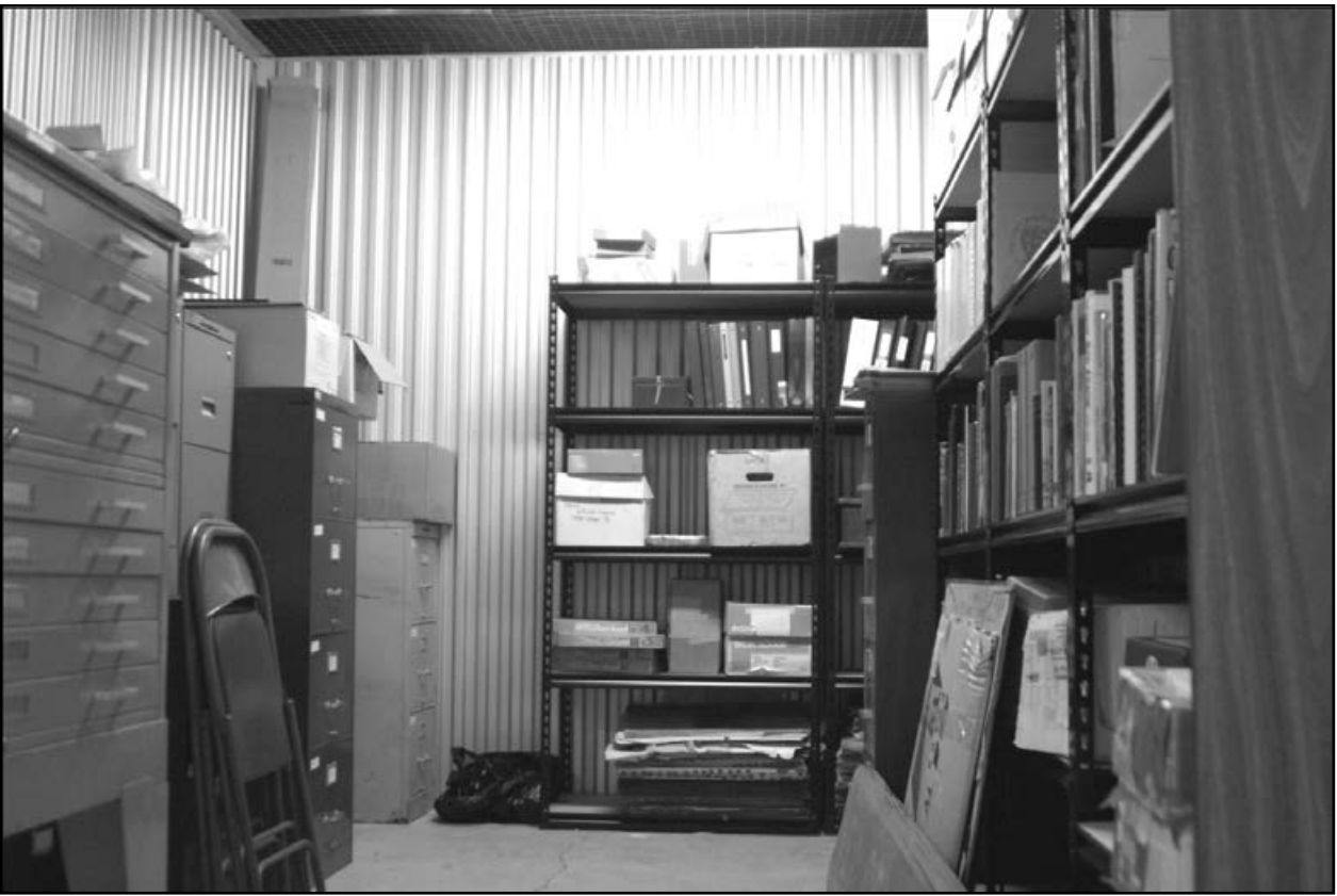
The new "closet" at Public Storage. Note the map cabinet at left.

Excerpted from Vol. 47 No. 2 of the Tredyffrin Easttown History Quarterly