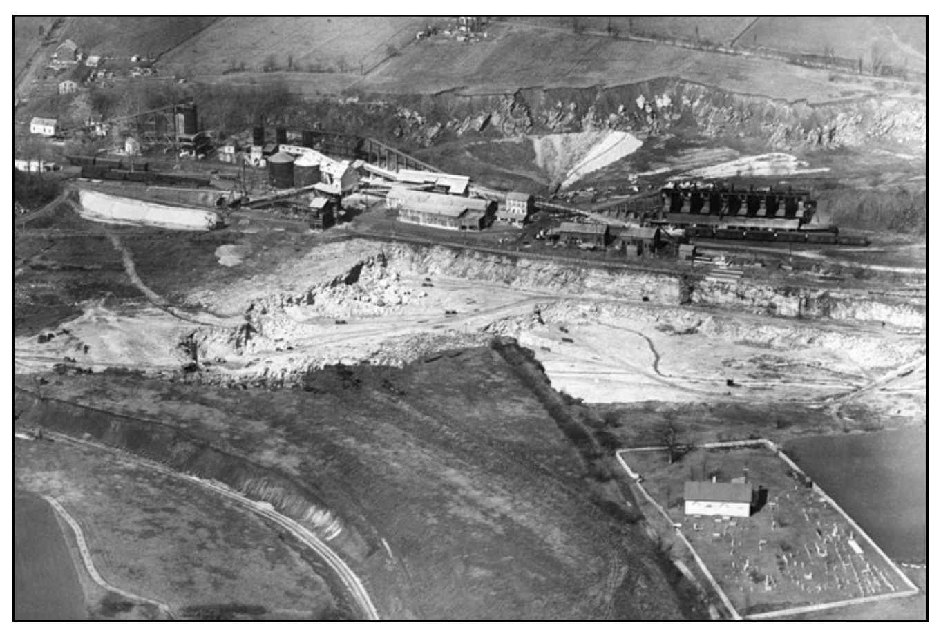
Image taken by Aero Services, 1927. Courtesy of Tredyffrin Easttown Historical Society Archives .

S aint Peter's Church in the Great Valley, built in 1744, is the oldest Episcopal sanctuary in Chester County. Restored and added to by R. Brognard Okie and Charles T. Okie in 1944-50, its high hill within the Valley has been used as a burying ground since the beginning of the 18th century. But the adjacent land contained high-quality limestone deposits, and by the 1920s strong demand had caused the Charles Warner Co. to expand its operation, and the precipice of its 250' deep quarry, to within less than 100 yards of the church property. The very survival of the parish, at bottom right in the photo above, was in doubt.