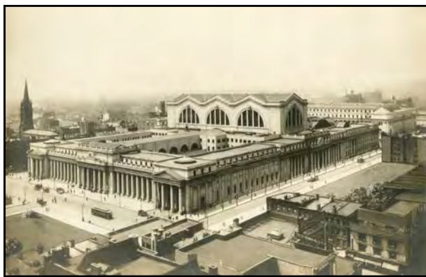
The brainchild of Alexander Cassatt, New York City's Pennsylvania Station opened in 1910, and was demolished in 1963.

I'm sure other Society members have stories that are waiting to be shared with future Quarterly readers, so don't be shy! We're waiting to hear from you.