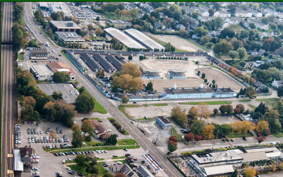
2009 aerial photograph looking east-southeast across the Devon Horse Show and Country Fair