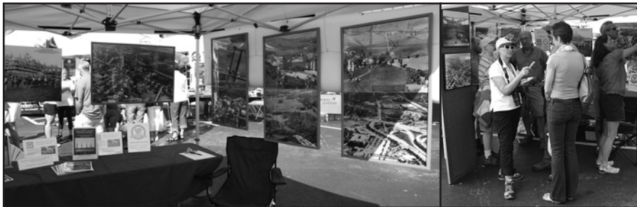
TEHS exhibit tent at 2013 Paoli Blues Fest.