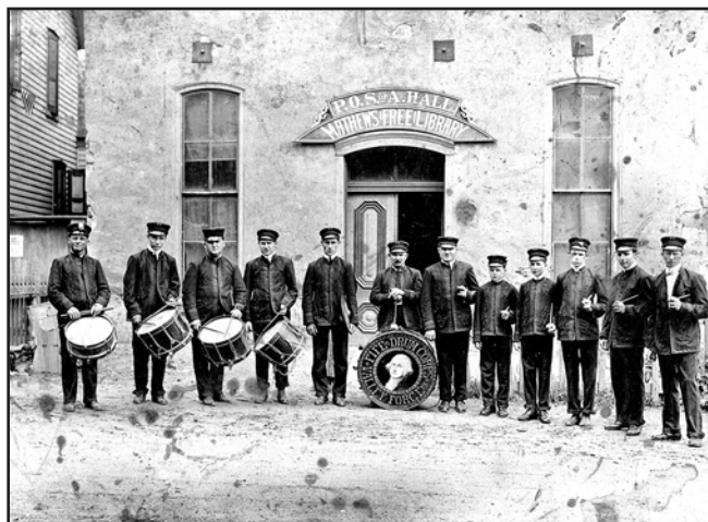
VFV16 – Valley Forge Fife and Drum Band outside the POSoFA (Patriotic Order of Sons of America) Hall & Mathews Free Library in a 1910 photo. The band was organized October 1908.