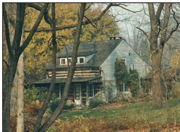
HLC09 – “Heyburn Royce” log cabin c. 1990

We hope that you will enjoy these recently added images as much as we have. Browse through our collection of photographs, available at the Image Collection link from our main tehistory.org website. If you are looking for information about a specific image from this article, enter the image identifier code in the Quick Search text box. You can also use the Advanced Search link to do more complex searches, or just enter appropriate descriptive information about a person, place, event or other information that may help to narrow your inquiry. Our large and growing image database is both a very useful research tool and a great way to explore local history by looking at amazing pictures. You are invited to utilize and enjoy this wonderful resource.