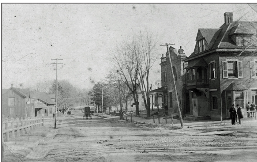
ABOVE: Undated example (LAB18) of our collection of historic images of Lancaster Avenue in Berwyn.