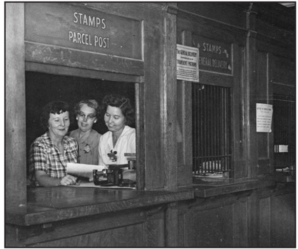
ABOVE LEFT: PP09 – Paoli Post Office, 1 September 1929 to 20 June 1955. ABOVE RIGHT: PP19 – Staff members at counter window. Both images are from the collection of photos documenting the Paoli Post Office and its employees. Related references: “Post Offices in Paoli: A Brief Photo Essay” TEHCQ Vol. 40 No. 4 (October 2003) and “The Paoli Post Office” by Katharine M. Stroh, TEHCQ Vol. 9 No. 2 (October 1956).