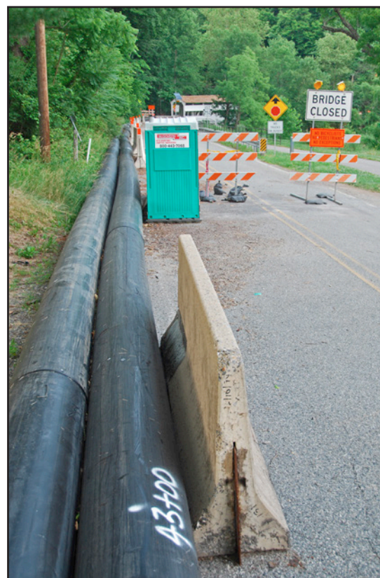
Bypass pipelines running along Yellow Springs Rd. toward the Knox Covered Bridge.

The process of installing a plastic liner inside the pipe required significant excavation in multiple areas along its length, and heavy and specialized equipment was brought in.