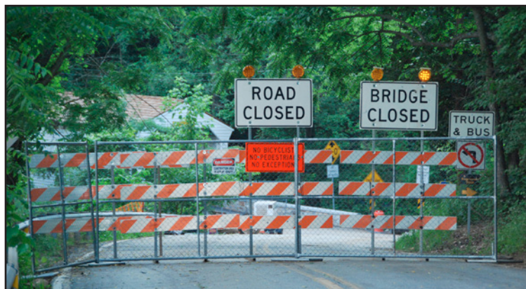
Route 252 closed at the Knox Covered Bridge.

In addition to the almost-completed repairs to the iconic Knox Covered Bridge necessitated by the unfortunate truck collision in July 2015, another big project is under way in Valley Forge National Historical Park (VFNHP).