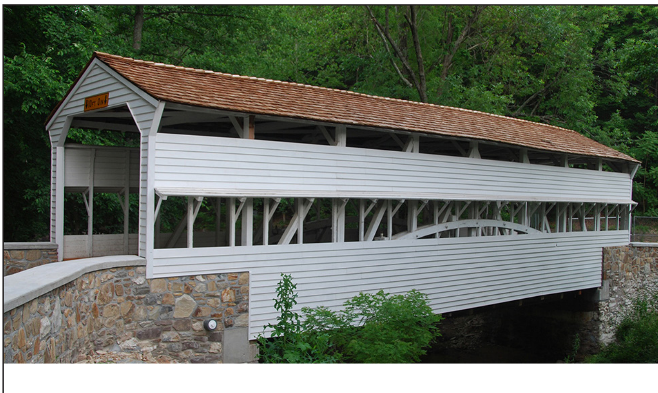
Restored Knox Covered Bridge. 24 June 2016.