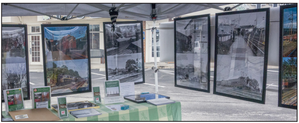
TEHS exhibit tent at the 2016 Paoli Blues Fest, before the crowds arrived.

As we began our Fall season of meetings, the Society participated very successfully on three consecutive autumn Saturdays in outreach programs to increase community awareness of our local history, and a brief report on those efforts is also included.