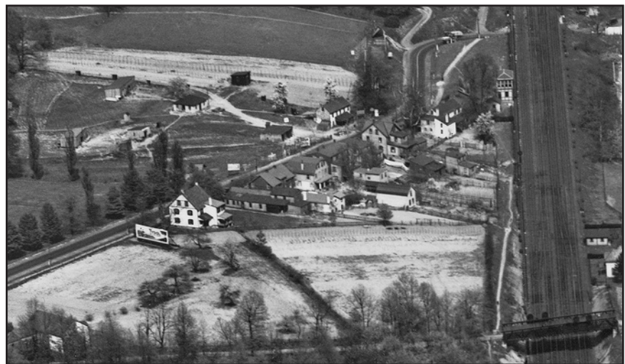
Aerial view of the fireworks factory site, looking northeast, 1926. The various separated structures may be seen just above and to the left of the residences in the center.