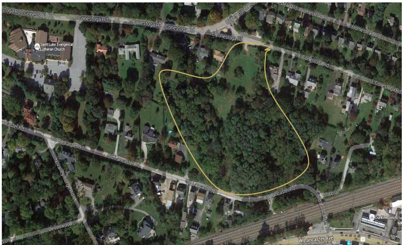
Aerial view of the Westover Park area.