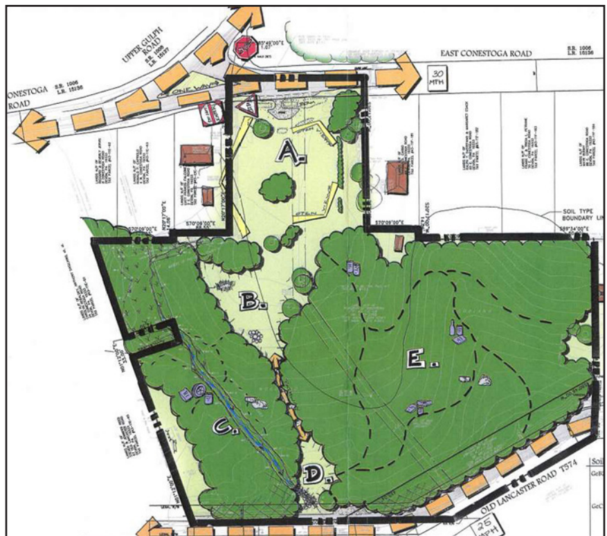
Artist's rendering as the park existed in the 2006 proposed Westover Park Master Plan prepared by Yost Strodoski Mears for the Tredyffrin Township Board of Supervisors,