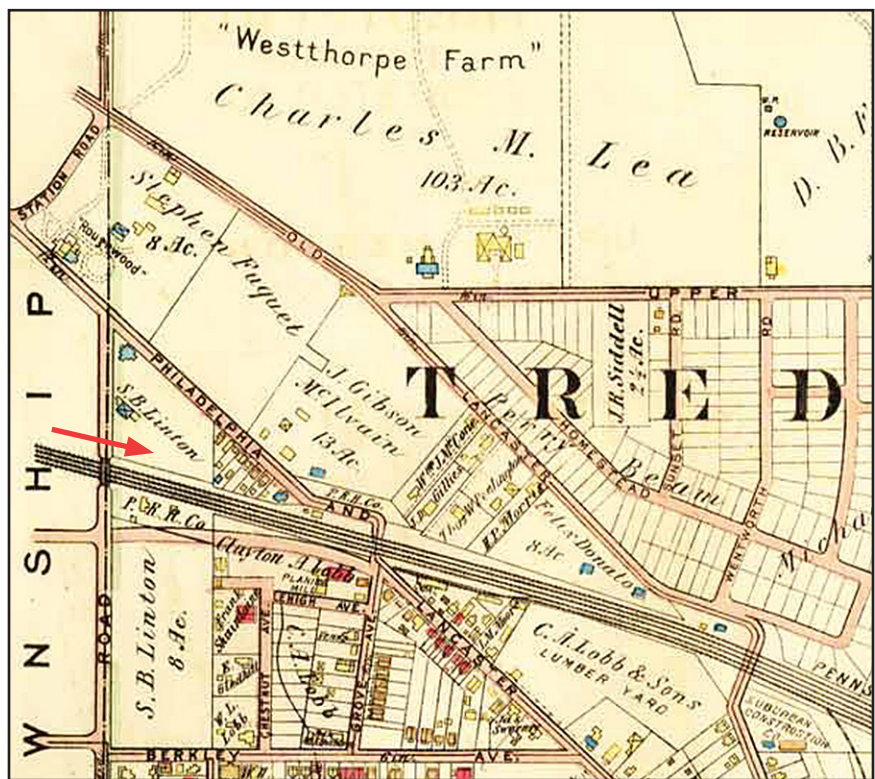
Section of a 1926 map 3 showing the vicinity of the fireworks factory. Note that the road identified as "Old Lancaster" is now known as Conestoga Road, and the road identified as "Philadelphia and Lancaster Turnpike" is now known as Old Lancaster Road.

The blasts were so powerful that strong concussions were felt on Grove Avenue, a large Italian community, on the south side of the train tracks, across Lancaster Pike. Property damage was significant and many nearby homes were knocked off their foundations, and countless windows were shattered all along Lancaster Pike. The nearby Betner Company paper bag factory building had 1,700 windows blown out, causing $40,000–$50,000 in damage. Over 20 people were injured by flying glass. Even a passing train on the nearby railroad tracks was rocked and windows blown out. Due to the direction of the blasts, most homes on Grove Avenue were declared uninhabitable for three to six months. Ms. Cappelli described how her father's family of eight children had to stay with family and friends living elsewhere during this time. At the time of the