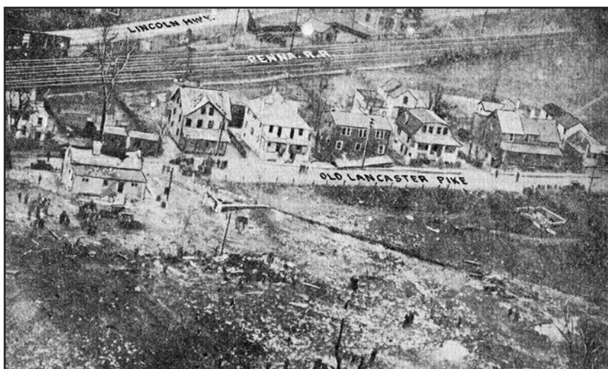
Aerial view of the site of the explosion. The area of debris in the foreground of the picture is where ten factory buildings stood. The home of the factory owner is in middle at left, and the nearby highways and railroad tracks are shown.

According to our researchers, in 1952 the property was conveyed to Martin Spinelli, owner of Devon Building Supply Co., who in turn sold the property to Westover Builders, Inc. in 1964. Although Westover applied to build various structures on the property, township approval was never granted and the property remained vacant until 2002 when Tredyffrin Township purchased the property at a price well below market value with funding assistance from the Chester County Commissioners’ Open Space Municipal Grant Program, and the Pennsylvania Department of Conservation and Natural Resources, Bureau of Recreation and Conservation. The conveyance was under, and subject to, restrictions that the property be used as a public park or recreation area in perpetuity and that the name of the Weissenberger family or