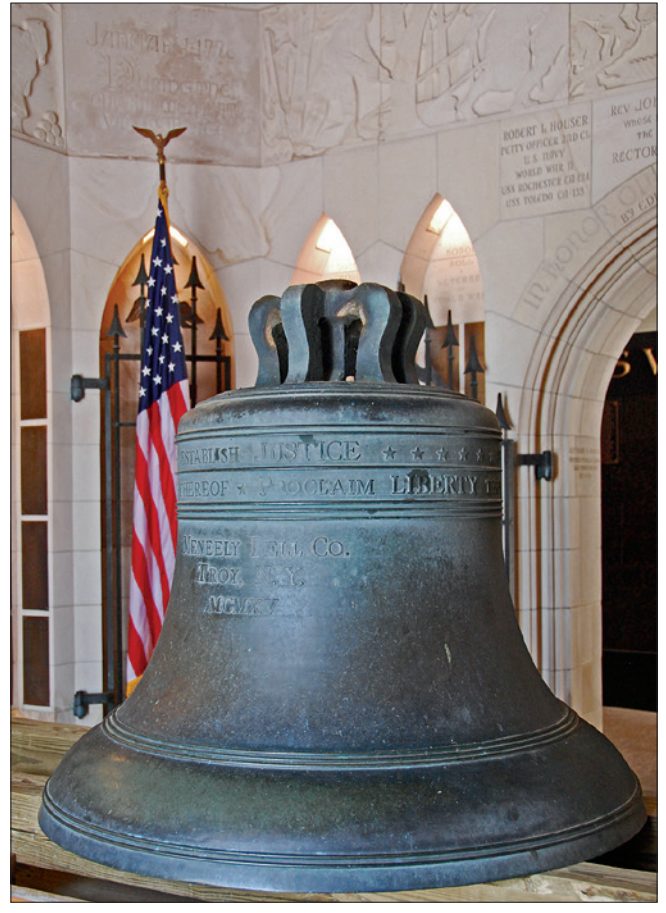
The Justice Bell, with the yoke removed, June 2017.