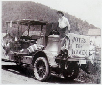
Cast in 1915, this Liberty Bell Replica toured cities and towns in Pennsylvania in support of Women's Suffrage.

Thanks to grants from the Pennsylvania State Society DAR and the National Society DAR, the yoke will be replaced.