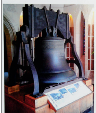
After 100 years, cracks have developed in the bell's yoke, causing the bell to sag.

Thanks to grants from the Pennsylvania State Society DAR and the National Society DAR, the yoke will be replaced.