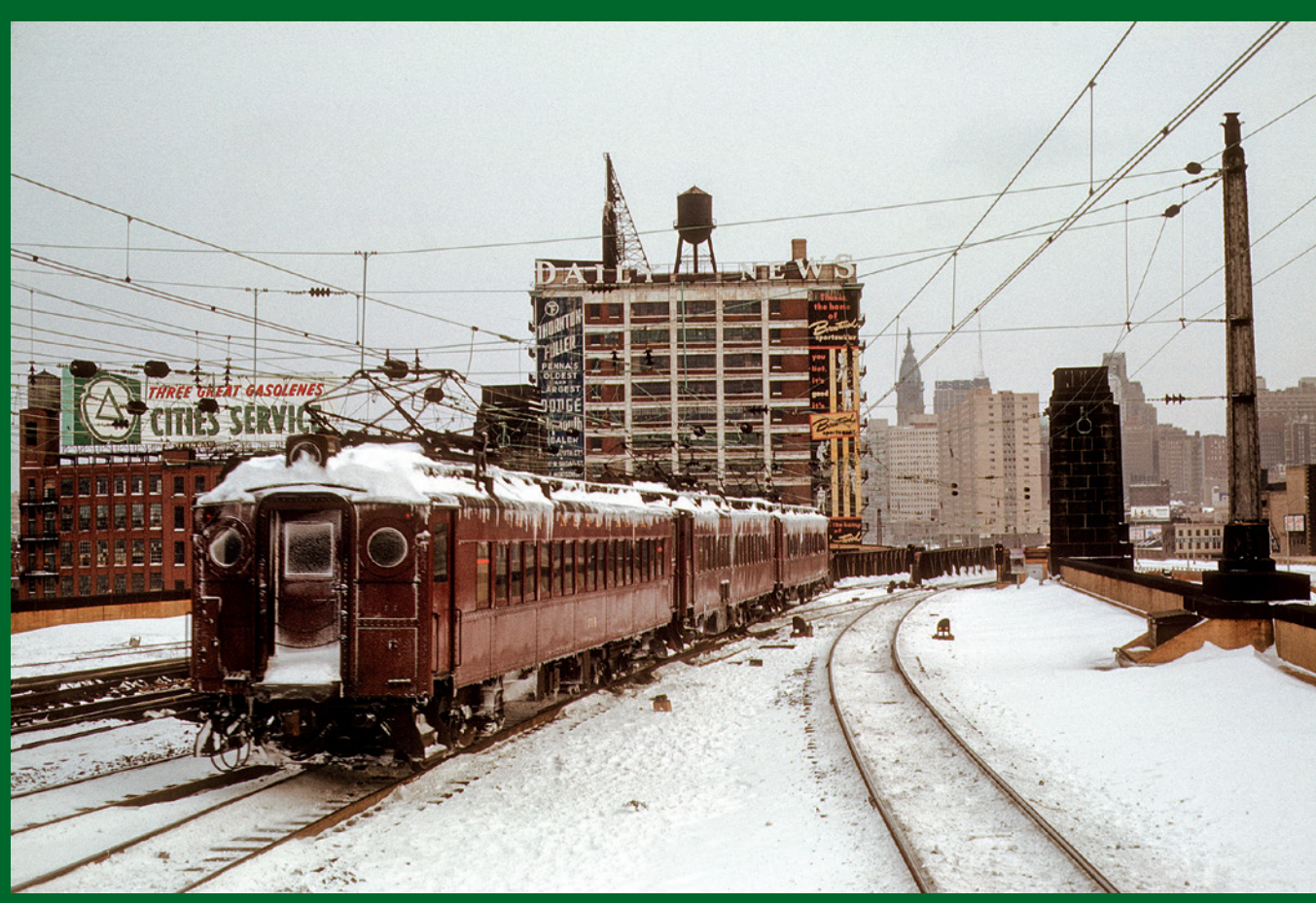
A three-car train encrusted in ice departs 30th Street Station bound for Suburban Station in December 1960.