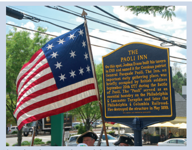
The Paoli Inn historic marker was dedicated at a ceremony in May 2019.

We also note the recent dedication of historic markers in two important locations, the first recognizing prominent local artist Wharton Esherick, and the second recognizing the historic Paoli Inn. Both are welcome additions to our community.