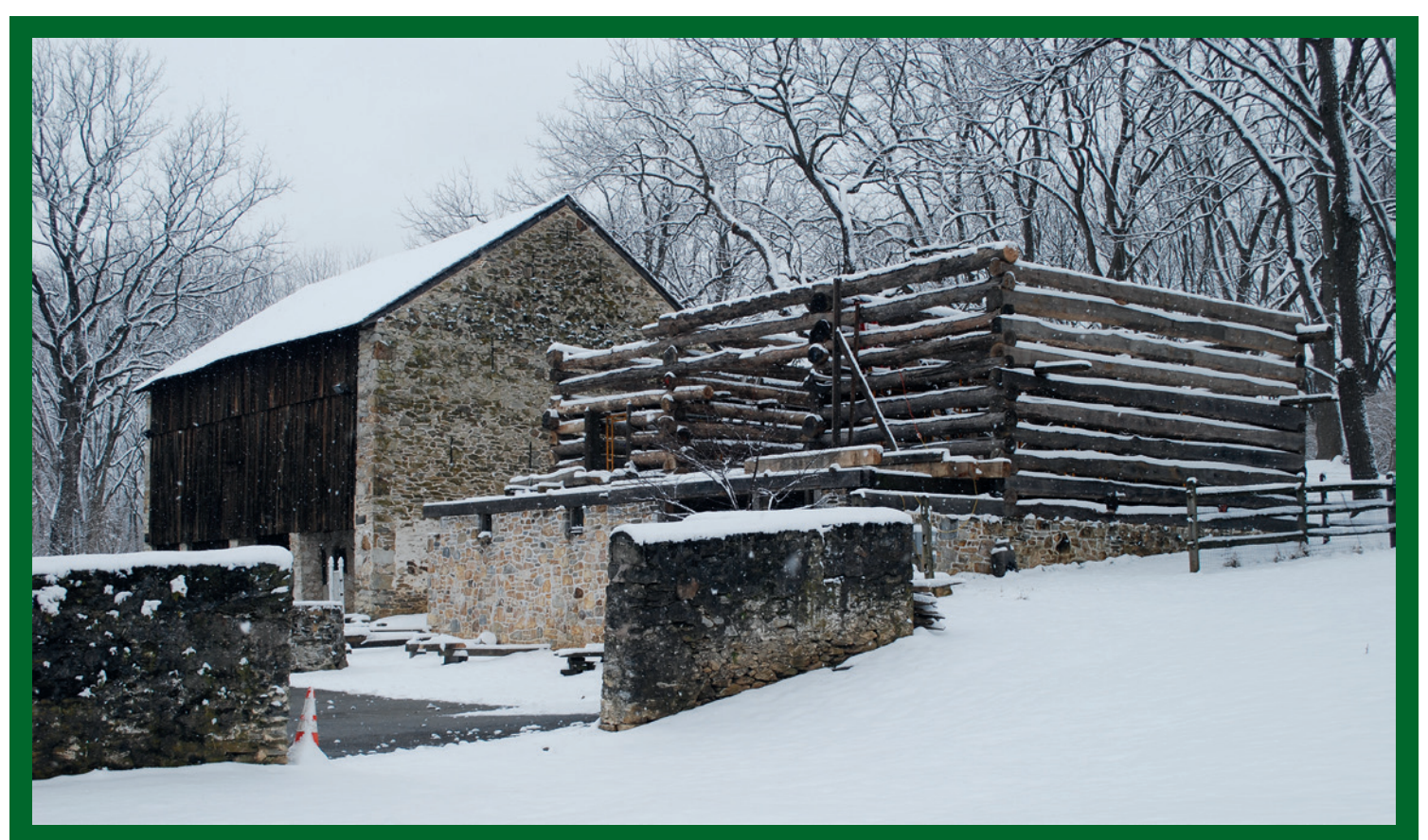
The almost complete log structure of the Jones Log Barn is covered with late winter snow (March 2019).

The framing of the roof and front section takes shape in the spring (May 2019).