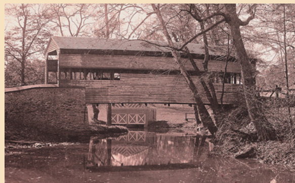
KNOX COVERED BRIDGE, C.1910